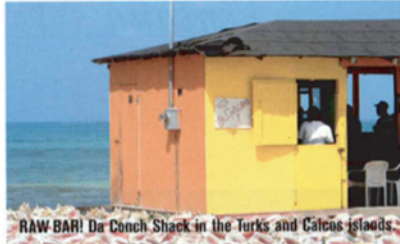
RAW BAR! Da Conch Shack in the Turks and Caicos islands.