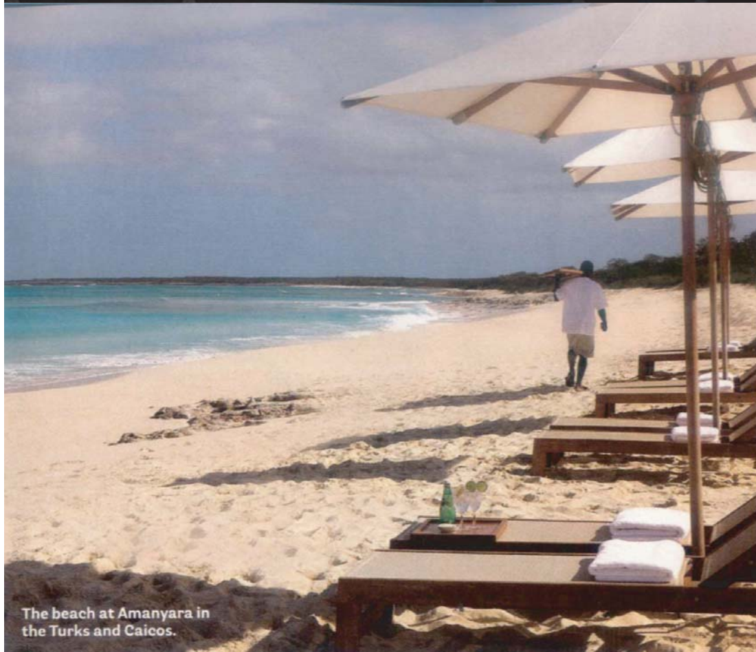
The beach at Amanara in the Turks and Caicos.