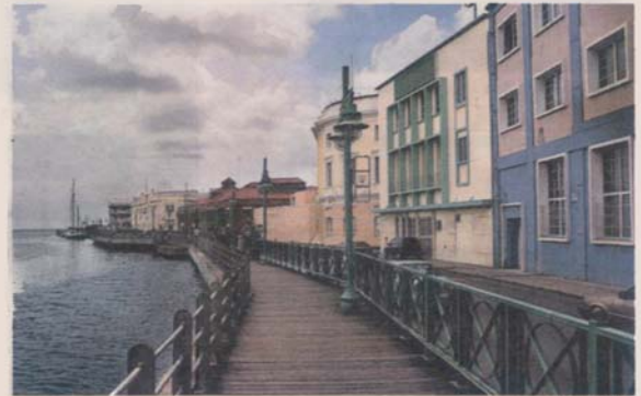
The docks in Bridgetown, Barbados

SERVED BY American and Air Jamaica from Kennedy.