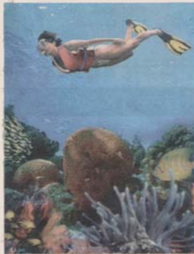
Snorkeling in Cancun, Mexico

WHAT'S NEW With new luxury hotels like the 371-room Aqua